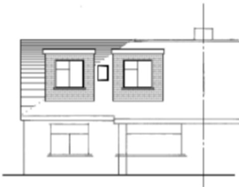
Proposed South/Front Elevation