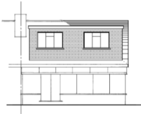
Proposed North/Rear Elevation